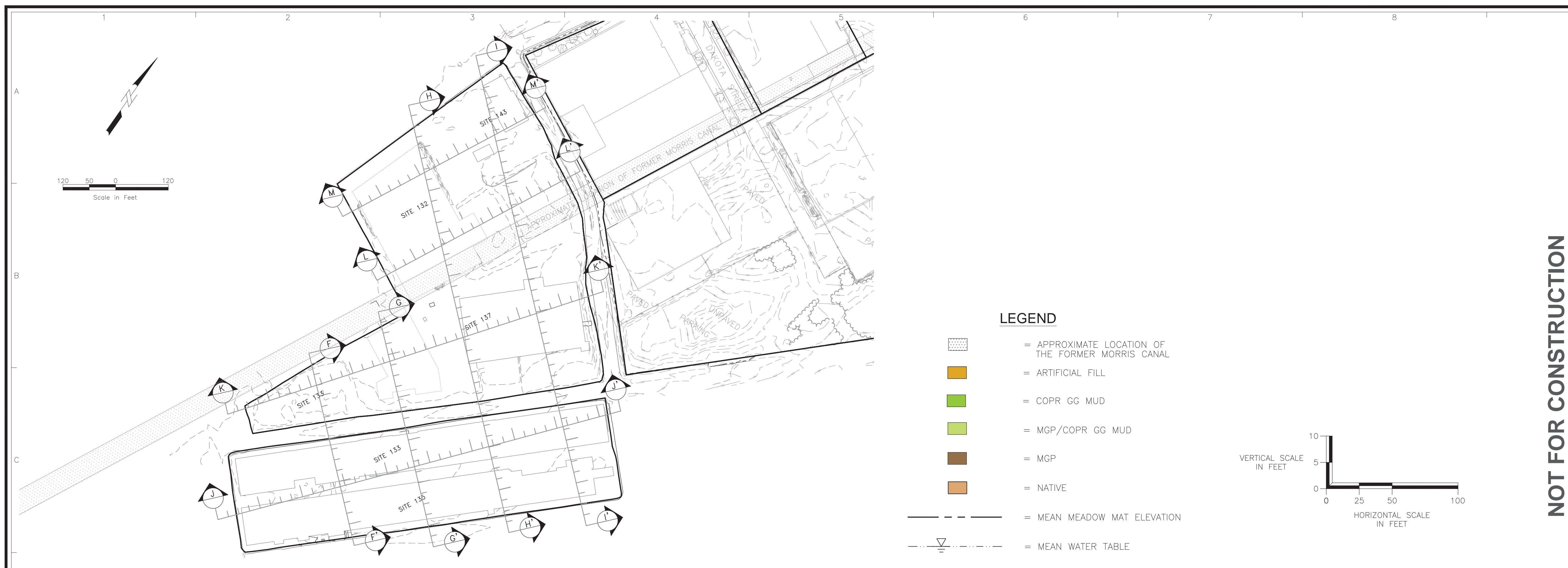
SITE LAYOUT AND CROSS SECTION LOCATIONS

File: s:\nem_eng\Project Files\PPG Industries\Garfield Avenue\RM_Design\Design\Cross-Sections\Cross-Sections_12-05-11.dwg Layout: M-M User: hnsir Plotted: May 22, 2012 - 1:04pm Ref's: