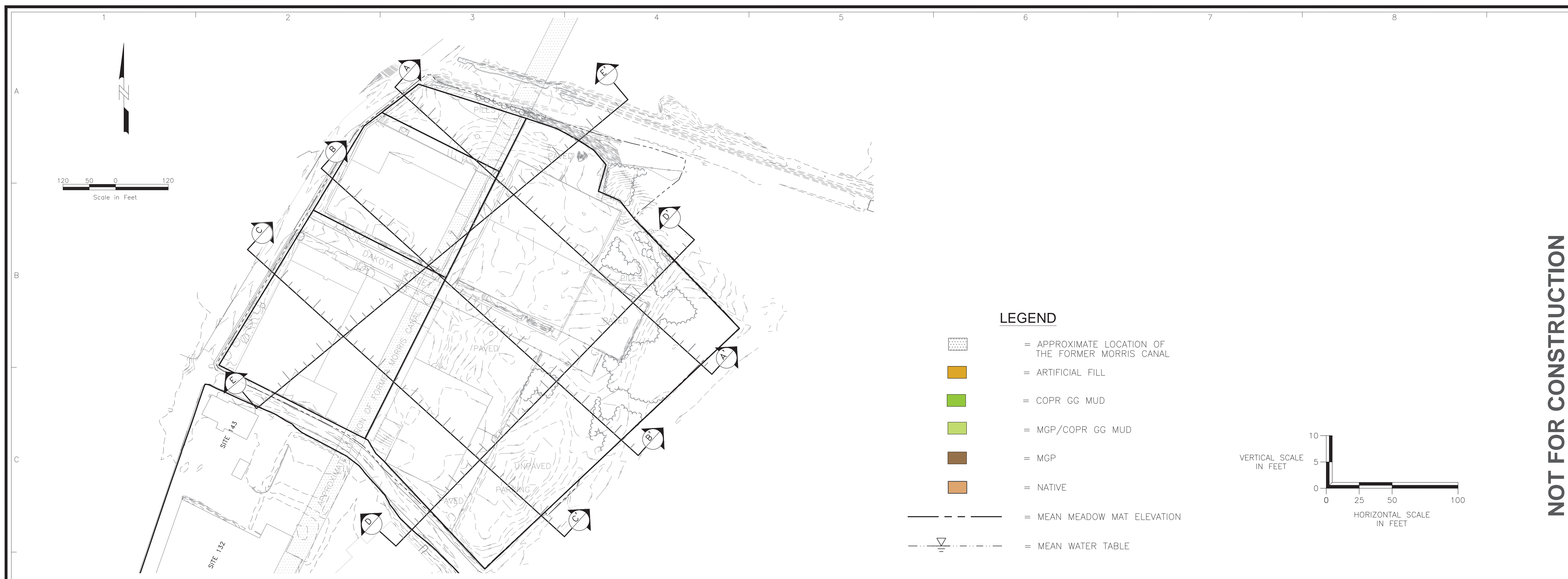
SITE LAYOUT AND CROSS SECTION LOCATIONS

File: \\nrc\Eng\Project Files\PPG Industries\Garfield Avenue\RM Design\Design\Cross Sections\Cross-Sections_12-05-11.dwg Layout: A-A User: mason Printed: May 22, 2012 - 10:03pm Xref's: