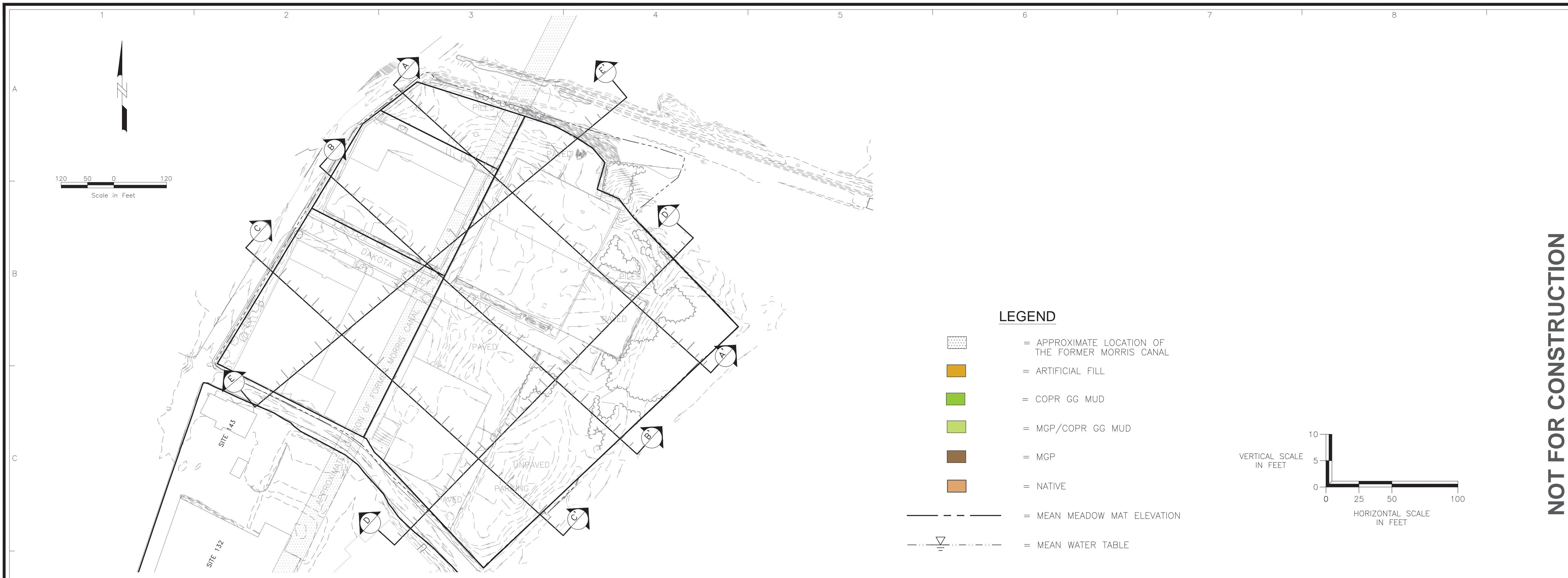
SITE LAYOUT AND CROSS SECTION LOCATIONS

File: s:\nem_eng\Project Files\PPG Industries\Garfield Avenue\DEM Design\Design\Cross Sections\Cross Sections 12-05-11.dwg Layout: D-D User: wisner Plotter: May 22, 2012 - 1:03pm Ref's: